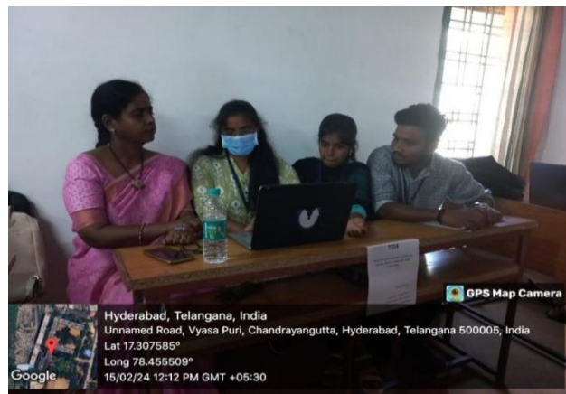
Dasari bhargavi(20E31A0549) Akitikaveri(21E35A0501) Jarpularavindher(21E35A0504) Project Tile : Detection of Cyber Bullying on Social Media Using Machine Learning